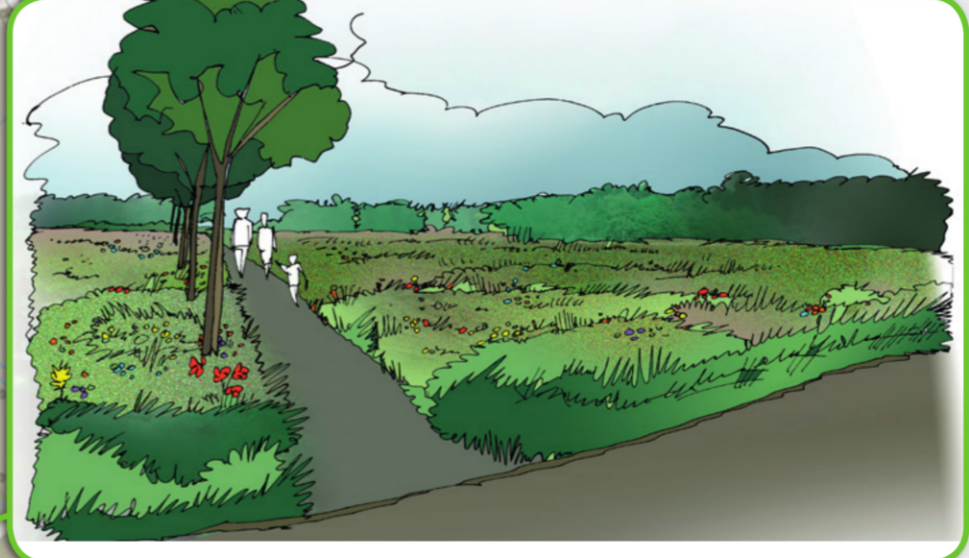
ALONG THE ULVENHOUTSE LANE= FOOTPATH AND DRY ECOLOGICAL CONNECTION TO ULVENHOUTSE BOS (WOOD)