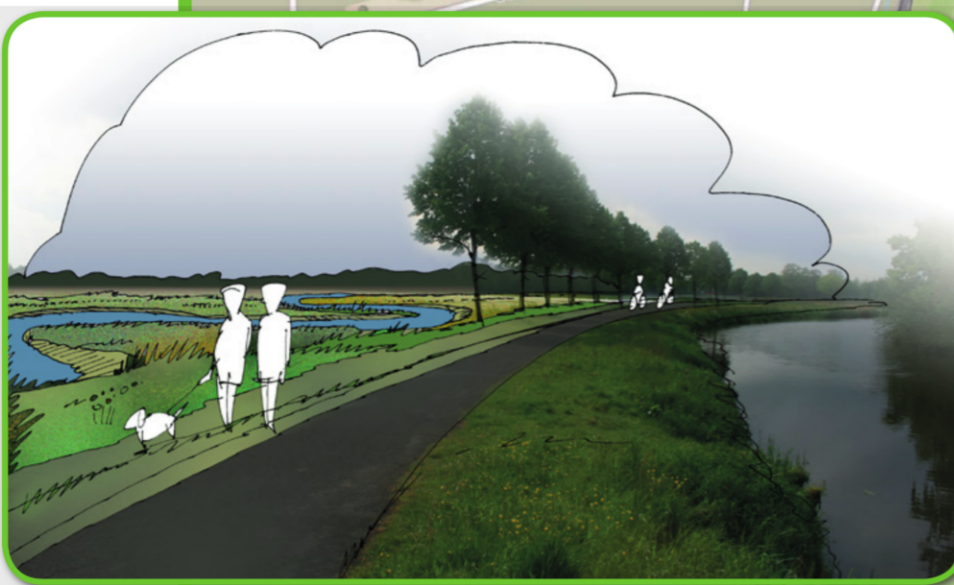
KOEKELBERG- EXTRA MEANDERS ON EASTERN BANK IN ADDITION TO CURRENT THROUGH GRASSLAND RICH IN HERBACEOUS PLANTS AND FAUNA