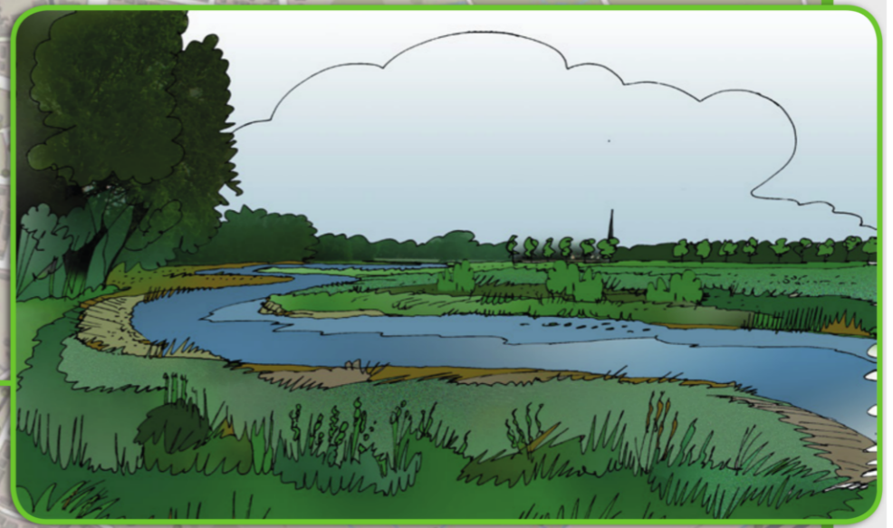
'BLAUWE KAMER' DAM AND PREVIOUS COURSE ARE ELIMINATED, MAKING WAY FOR NEW MEANDERS ON WESTERN BANK WITH WET HAY MEADOWS