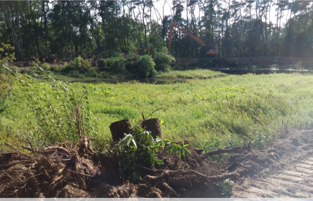
Ludwigia grandiflora and bamboo removal during the nature restoration works

By restoring the surrounding heathland, we increase infiltration of rainwater towards the fens and towards groundwater bodies. Moreover biodiversity flourishes in this important European habitat type